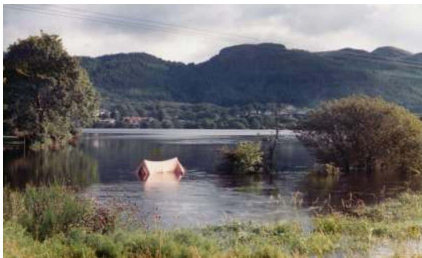
Aberfoyle: top: the view from the author's childhood house on Queen's Crescent. Middle: Aberfoyle from Manse Road and a camper under flood water from the River Forth.