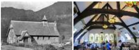
St. Kentigerna's Church, Inversnaid (c1900) and as The Bunkhouse Bothy— an important stop on the route of Great Highland Way. Note the windows dedicated to the Wise Women.

Because of its strategic location, the many famous travelers have passed Bruach over the millennia and have made the glen famous by recording their experiences for posterity. The Bronze Age people left their carvings on the rocks. In the 5th Century, St. Berach visited the district to sort out a dispute the priestly king Aedan had with an Irish wizard. Among the most notable travelers were the Wise Women to whom a beautiful set of stained glass windows in St. Kentigerna's Church at Inversnaid were dedicated.