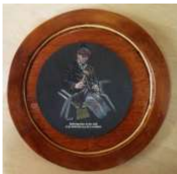
Cutting Roofing Slates

This was no ordinary slate and was considered a cut above all others because it came in several colours and called "Tartans" by slaters. For example, in last photo the slates were so valuable, that they were stripped from roofs of the "Cottaries" during their demolition and re-used in expensive architectural projects – notable churches.