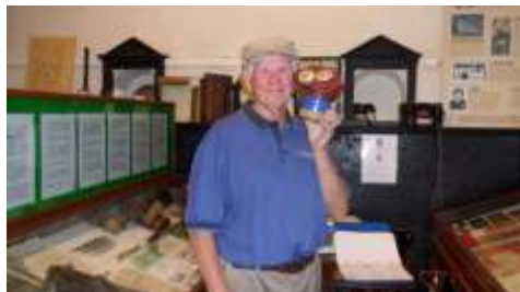
Sandy & WWII Mickey Mouse gas mask for babies.