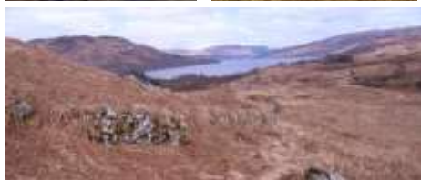
View from Bruach. Top: Loch Arklet and the Arrochar Alps. Bottom: Loch Katrine from the early 18 th century military road..

Bruach is located on the north side of Loch Arklet, near the junction of ancient cattle drove roads one leading to Loch Katrine eastward, Loch Lomond to the west and southward via Loch Chon and down Strathard to Flanders Moss and Stirling Castle.