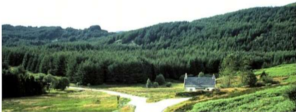
Top: Our wood house and the 'cottaries' c 1945. Middle, demolition of the last workers of the cottaries c 1960, and Aberfoyle School. Bottom: The manager's house and magnificent Forest Commission planted in the 1960's and photographed 1995.