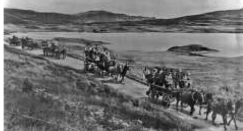
The Rob Roy coach at Inversnaid Hotel, and coaches passing Bruach on their way from Stronachlachar Pier on Loch Katrine to Inversnaid Hotel by Loch Lomond. This was the last public coach service in Britain which ceased in 1937.

As to the fate of the garrison, most of it has been recycled into the Garrison Farm and what was left of ruined barracks has ever since been used as a sheep pen. Nearby, behind the one-room Inversnaid Primary School, is the military graveyard with a dozen or so headstones bearing the inscription of some of the brave soldiers (mostly Highlanders) who died at the garrison 250 years ago.