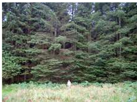
Transformation of the Duke's pass. 1950 (top), 1990 (middle) and, on the site of the

They were very hard times for workers, regardless of their occupation. But, for as a wee boy eager to explore from dawn to dusk the wild mountainous land of lochs and glens, of great beauty and full of livestock and wildlife, it was a happy time. The Cottary was a bustling village of about 20 families – mostly quarry workers families, but also a salesman, a forestry worker and others. The school building was still standing but not used. Instead, we walked the down the Duke's Pass to a beautiful school, beside the river Forth often through the ancient oak woods and the enchanting surroundings along the Loch Ard Road where the much wealthier folk lived in fine Victorian